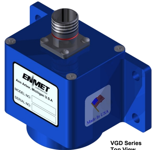
VGD Series Top View

The VGD series Sensor/Transmitter utilize electrochemical type cells to detect the target gas. These cells consist of electrodes, electrolyte and an air/liquid separation barrier. Gas molecules enter the cell and, as a result of an oxidation/reduction reaction, generate an electrical current proportional to the gas concentration. This current is measured, conditioned, and converted to the gas concentration digitally transmitted as a CAN bus beacon output signal. The data is also available for acquisition via RS-485 Modbus RTU. Calibration is handled via a PC interface software. These sensor/transmitters can also be connected to various computer based instrumentation for data acquisition and control.